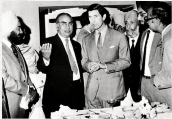
Prince Charles on a visit to the Hero Cycles plant in 1978.